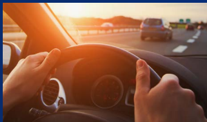
Travel and expenses

ePay is a secure, modular system that drives compliance, efficiency and reduced costs across: