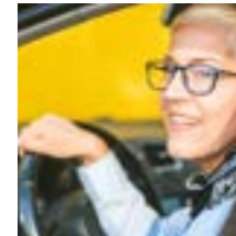
Approving vehicle set-ups